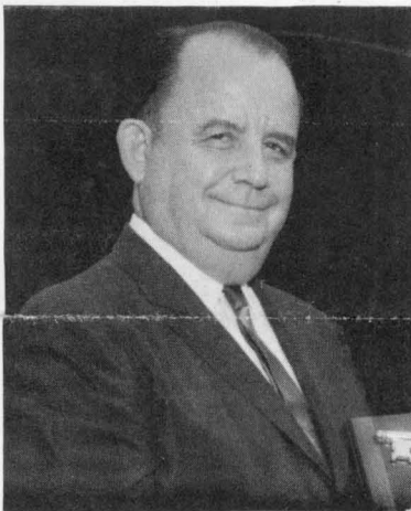
Governor John Dalton predicts ten thousand students to attend the St. Louis Campus by 1973

Ford was still riding a horse and Wilber and Orville were still wrestling with bicycles, so most of the club's 208 members made their way on the Burlington Railroad, which fortunately stopped almost at the club's back door, 12 miles from Union Station.