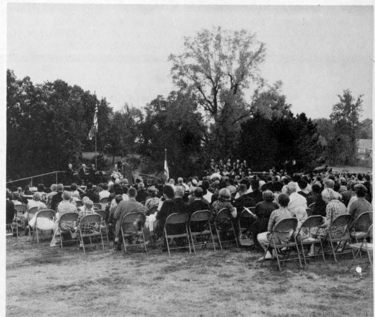
Between 1000 and 1500 people attended the dedication ceremony despite threatening weather conditions.

Thus did the Bellerive Country Club end its role in history of the St. Louis Campus and the Normandy School District begin its three years of hard work, planning and legislating in order to make Sunday, September 15 become a reality, the commitment of the Old Bellerive Country Club, Normandy Residence Center, to the University of Missouri-St. Louis.