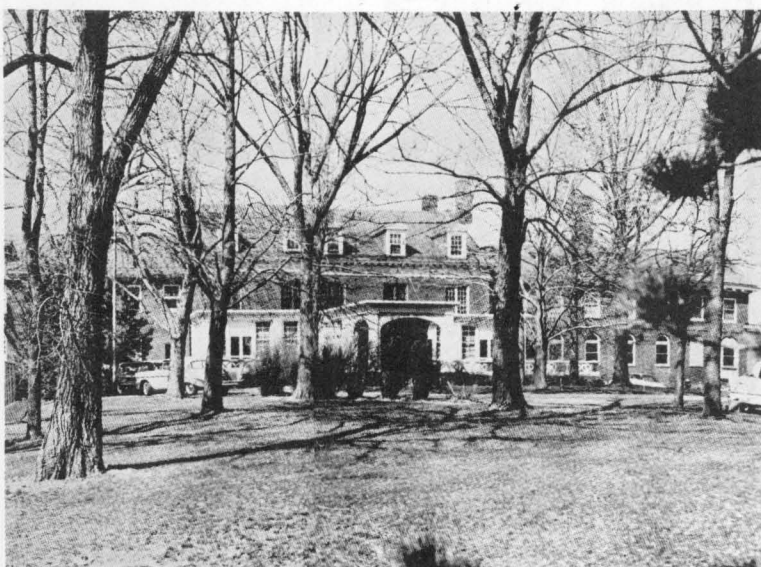
The St. Louis Campus, which was formerly the old Bellerive Country Club, as it exists today.

Under increasing pressure to move the old Field Club from Bellefontaine Road closer to member's homes, club officers soon set their sights on the property at 8001 Natural Bridge. Originally, the land was part of the 800 acre estate of John Lucas. He called it "Normandy"