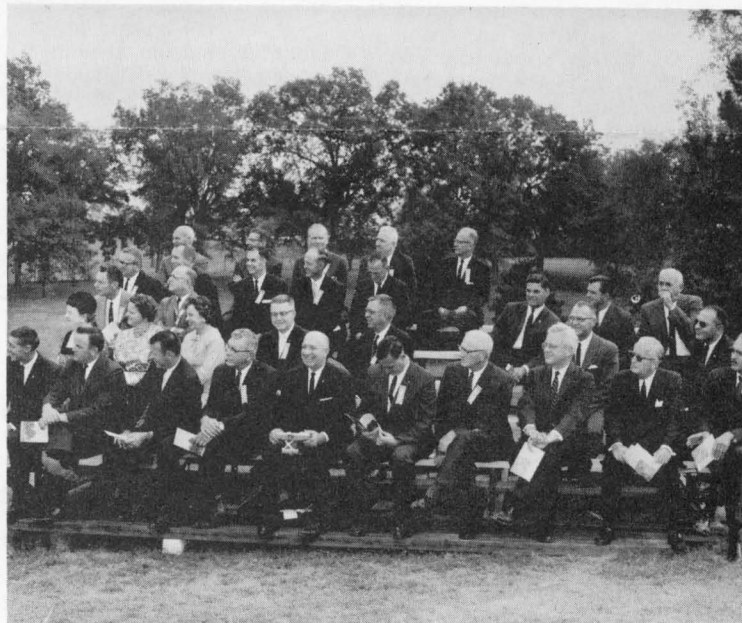
The Committee of Twenty-Eight, citizens of Normandy, who were responsible for the organization and foundation of the four year branch of Missouri University, The St. Louis Campus and other dignitaries who attended the dedication ceremonies.

After the dedication ceremonies, guests were invited to tour the building and view the three-dimensional model of the proposed campus development on display in room 108. Guest speakers and dignitaries received visitors on the patio and punch was served on the northwest tennis court.